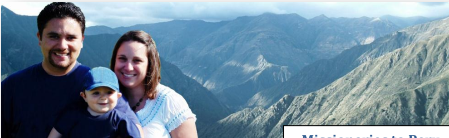
Missionaries to Peru

www.servinginkas.com Mid-February Letter '11