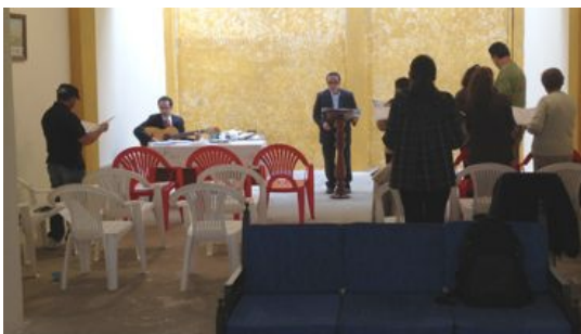
Sunday service in Tintal