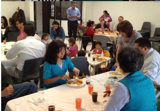
Family lunch at presbytery